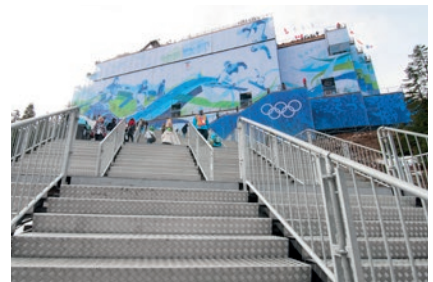
Winter Olympics, Vancouver