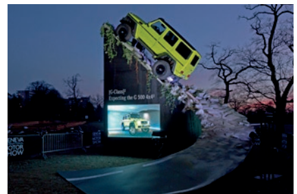
Mercedes Exhibition, Geneva Motor Show