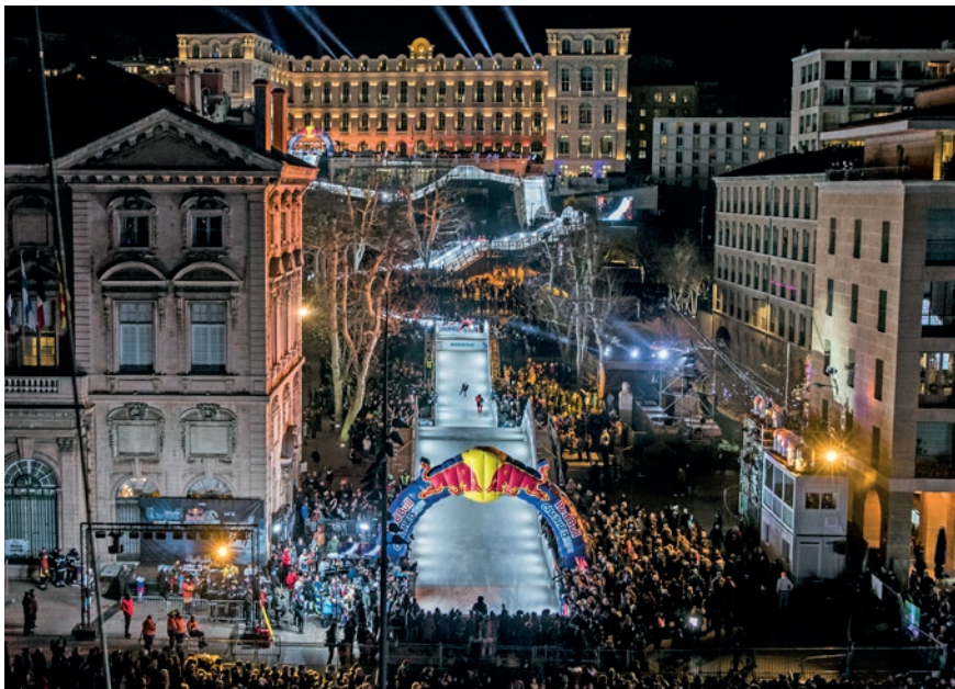
Red Bull Crashed Ice, Marseille