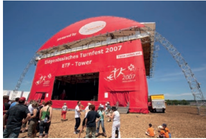
Swiss Gymnastics Festival, Frauenfeld