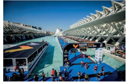
Valencia Trinidad Alfonso Marathon