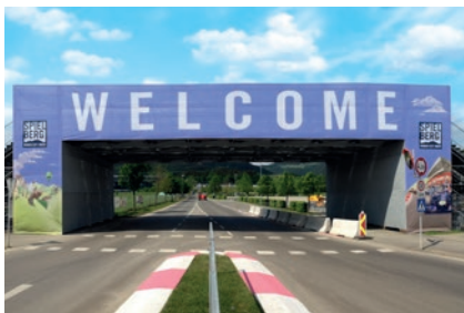
F1 Austrian Grand Prix, Spielberg